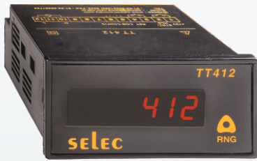
36 x 72mm